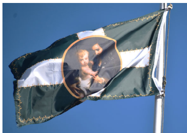
This month's flag is St. Joseph, father to Jesus Christ.